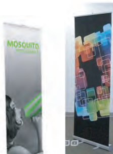
Retractable Banner Stand that can be used over and over. Easy set-up. Graphics included in price. 32" x 82" Includes Carrying Case $210.00