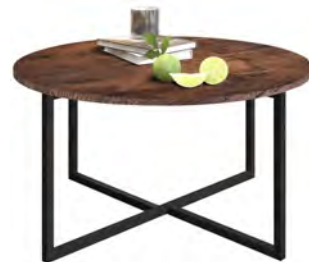
Round Coffee table 3 available

All furniture is a faux leather material