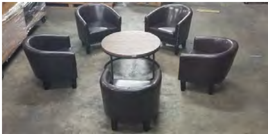
Club Chairs 6 available