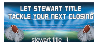
Our 2' x 6' booth horizontal banner can hang on the back of your booth. Single-sided with grommets for hanging. Banner material is heavy duty 13oz. Can be reused over and over. $95.00