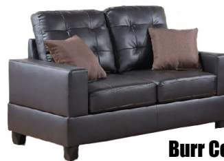
Burr Couch and Loveseat style only available in brown