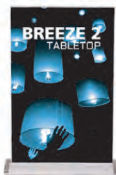
Retractable Mini table top Banner Stand that can be used over and over. Easy set-up. Graphics included in price. 11" x 17" $55.00

ALL CANCELLATIONS FOR ITEMS ORDERED MUST BE MADE 5 BUSINESS DAYS BEFORE THE EXHIBITOR MOVE IN DATE TO RECEIVE A FULL REFUND. ITEMS CANCELLED AFTER THE 3 BUSINESS DAYS BUT BEFORE THE EXHIBITOR MOVE IN DATE WILL BE SUBJECT TO A RESTOCKING FEE OF $25.00. ANY ITEMS DELIVERED TO THE SHOW SITE OR ITEMS REQUESTED TO BE REMOVED BY THE SHOW REPRESENTATIVE FOR ANY REASON WITHOUT PRIOR CANCELLATION WILL BE CHARGED AT FULL PRICE EVEN IF REFUSED AT BOOTH.