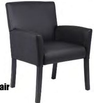
Black Executive Chair 6 available