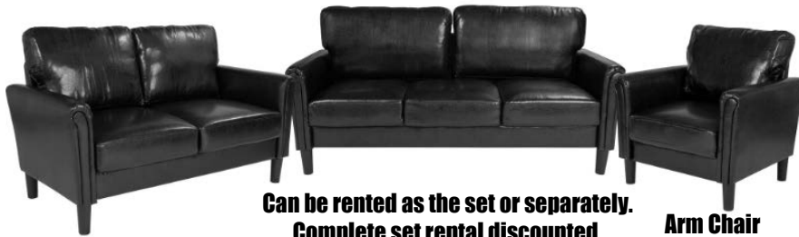
Can be rented as the set or separately. Complete set rental discounted. style in black & brown